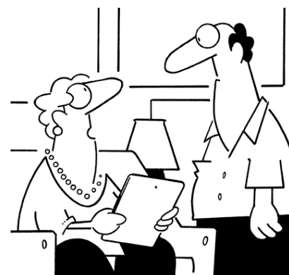
"I'm reading an updated version of Romeo and Juliet. This time their relationship comes to a tragic end when she unfriends him on Facebook."