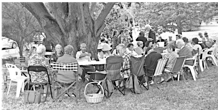
Parishioners from St Joseph's at a picnic lunch in Kelly Grove following Mass last Sunday.