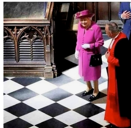
A moment of tension in the Vatican. If the Bishop moves forward, the Queen can take him.

This week's gospel talks about weeds and wheat and how to handle them. We all need spiritual neighbours who have learned a thing or two about the weeds and the wheat and how they crop up in our lives. Listen to the people who know. Cultivate sources of wisdom in your life - the sacraments, good spiritual reading, daily prayer - and pay attention to them. Because life isn't just a bed of roses. GPBS eNews