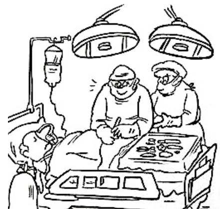
"I can tell the embroidery classes have helped."