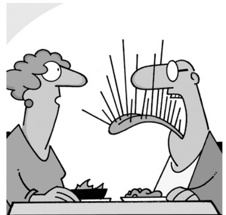
"Tell me more about the Acupuncture Diet. Does it really work?"

One particular four-year-old prayed: 'And forgive us our trash baskets as we forgive those who put trash in our baskets.'