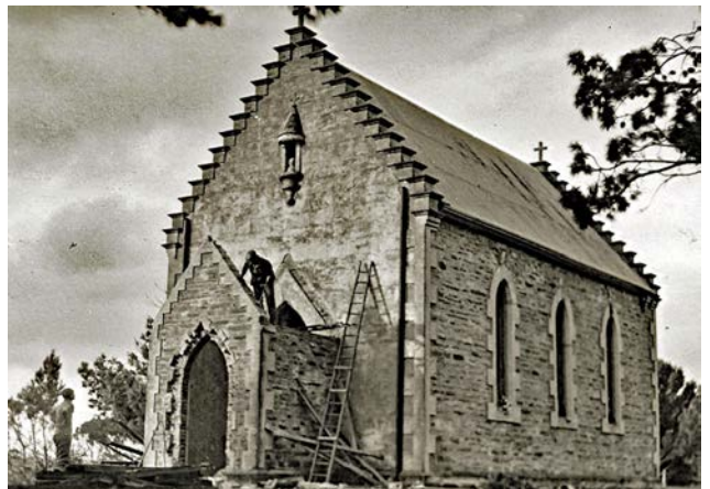
Above: St John's Church under demolition (SLSA B 9495)