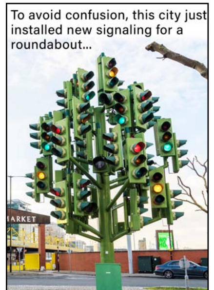
To avoid confusion, this city just installed new signaling for a roundabout...