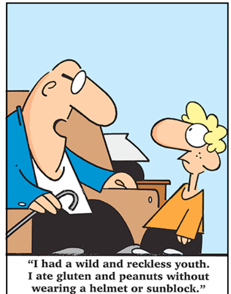
"I had a wild and reckless youth. I ate gluten and peanuts without wearing a helmet or sunblock."